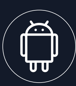
Android 14 Operating System