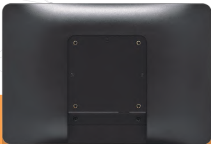
Ultra- Slim with VESA 75 x 75mm Support

Interface: HDMI or USB or USB-C (Alt mode) Ultra-thin design is better paired with USB-C Capacitive touch as option. Black or white chassis as standard.