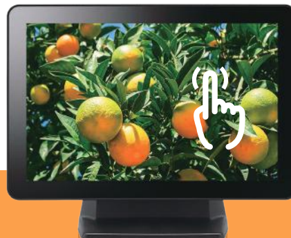
Solid Metal Stand