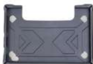
Leather Case (Optional)