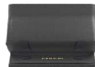
Docking Charger (Optional)