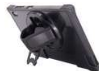
Rotating leather sleeve (Optional)