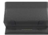
Docking Charger (Optional)