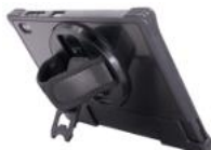
Rotating leather sleeve (Optional)