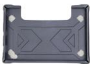
Leather Case (Optional)